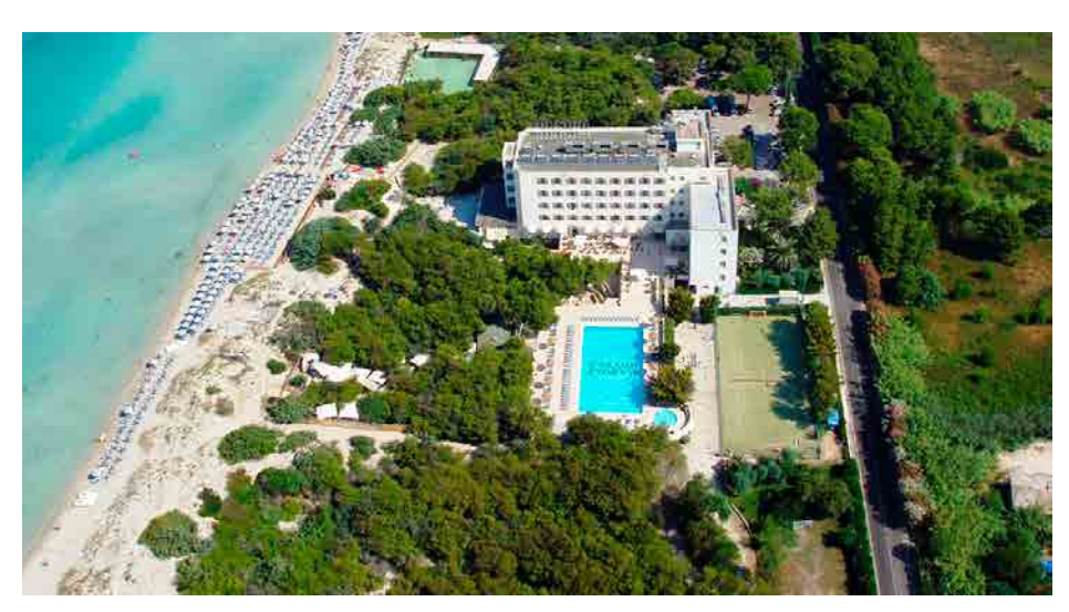
Hotel Ecoresort Le Sirenè di Caroli Hotels, posizionato in un'oasi verde a circa 10km da Gallipoli

All cash prizes are shown gross and will be paid to the winning player by bank transfer net, withholding whatever is required by Italian tax law.